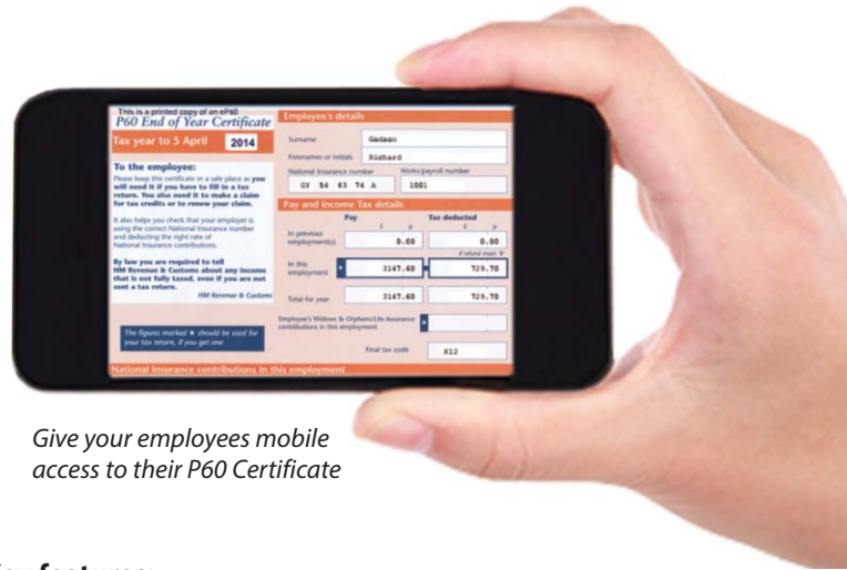
Give your employees mobile access to their P60 Certificate