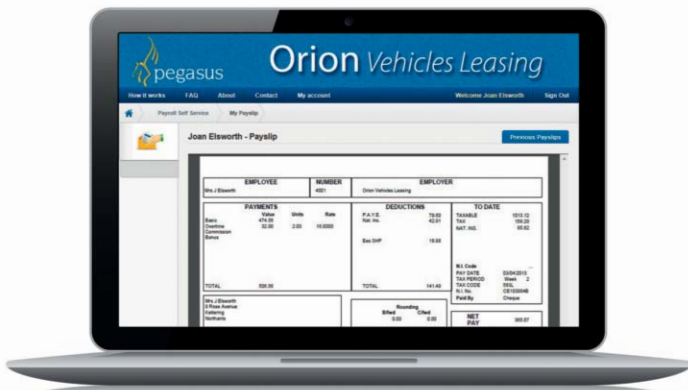
Employees have instant, secure access to their payslips

Find out how much your business can save in printing and postage costs with our ROI Calculator. Visit www.pegasus.co.uk/calculator .