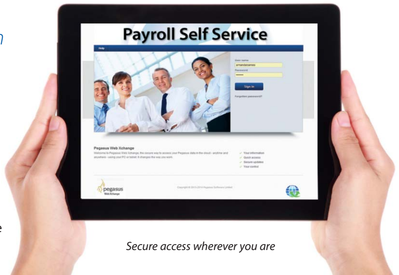
Secure access wherever you are